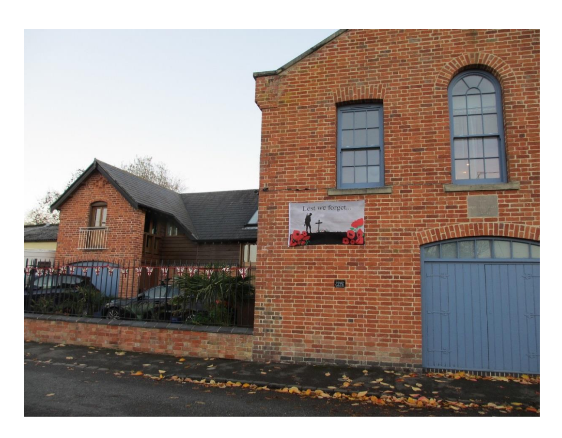
Remembrance Sunday 2018, commemorating the Centenary of the signing of the 1918 Armistice.

The building in its prominent position in the centre of the village is now an asset instead of an eyesore.