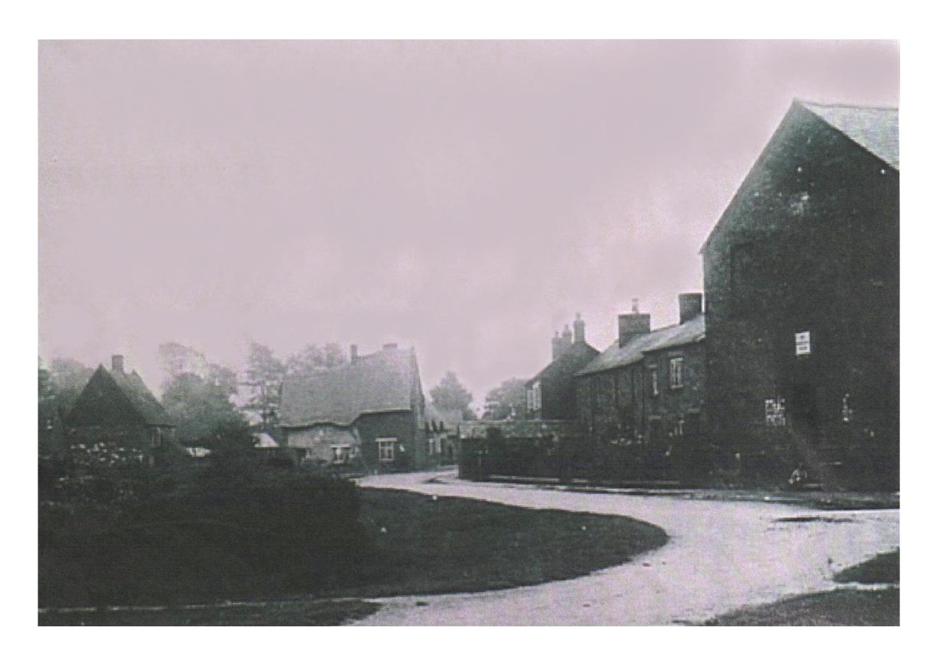
The Chapel c 1920 on extreme right with Chapel Row beside it, leading down to Rectory Lane

The 1851 Ecclesiastical Census records that it was "a separate and entire building used exclusively for worship, with room for 120 standing". The average morning attendance was 100. The return was signed by the Minister at Kilsby, James Rhys Jones.