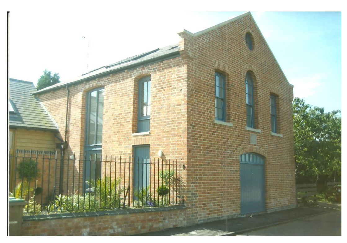
The Old Chapel as a private dwelling in 2007 (BLHG P13/117)

The Chapel was bought by an architect in 2005. While remaining true to the Chapel's original external appearance, the crumbling brickwork was replaced after the rear wall collapsed while new footings were being put in. An extension was built to the side on part of the adjacent factory site which the new owner acquired.